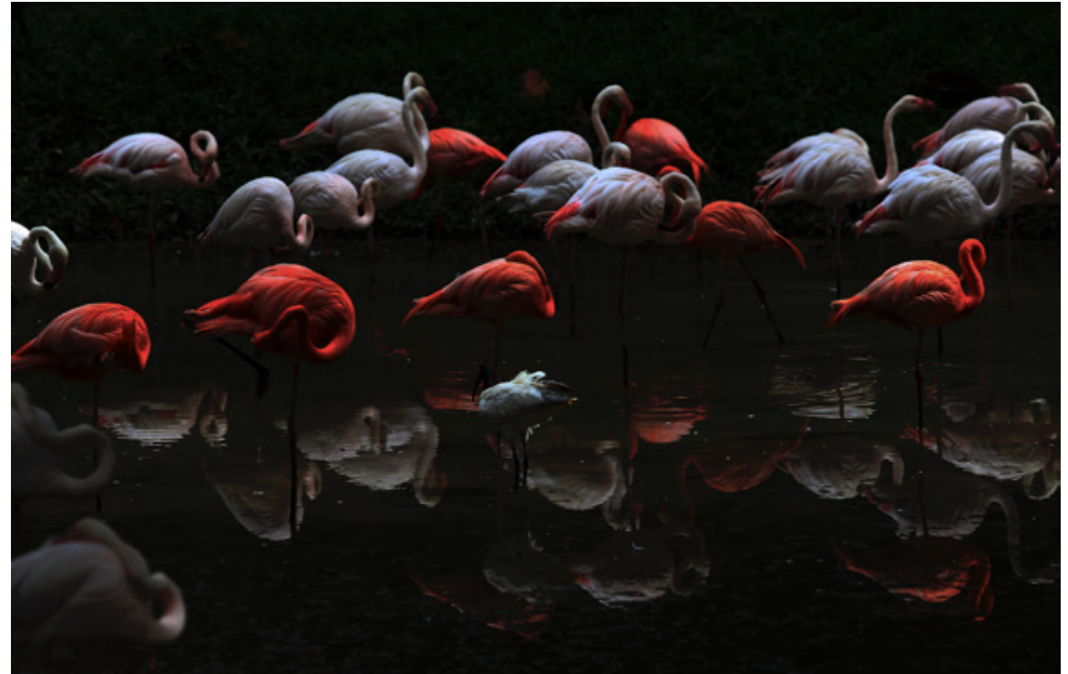
Zulfadhli Zulkifli Zoo Negara, Kuala Lumpur, 2016

The flamingo conference, attended by Caribbean Flamingoes and Greater Flamingoes, to discuss sustenance and community concerns at Zoo Negara.