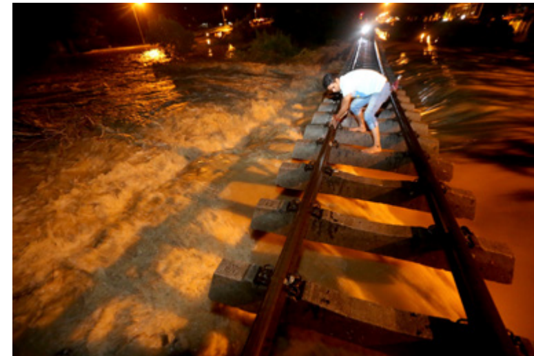
Adi Safri Jalan Genuang, Segamat, Johor, 2017

Pathway to safety - a motorboat is seen carrying people through a flooded road in Kuantan, Pahang.