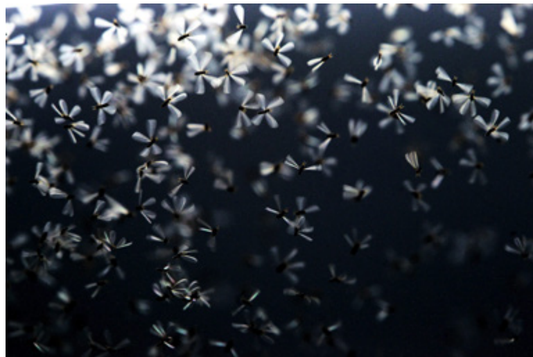
Fariz Iswadi Ismail Putrajaya, 2012

Come... let's go somewhere safer. The flood is worsening.