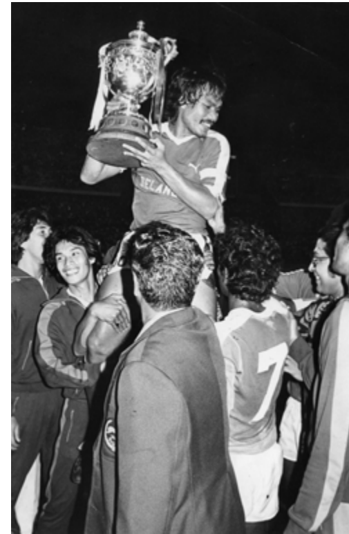
NSTP Archive Merdeka Stadium, Kuala Lumpur, 1979

Ah, the water feels so good! How a bird cools down during the hot weather.