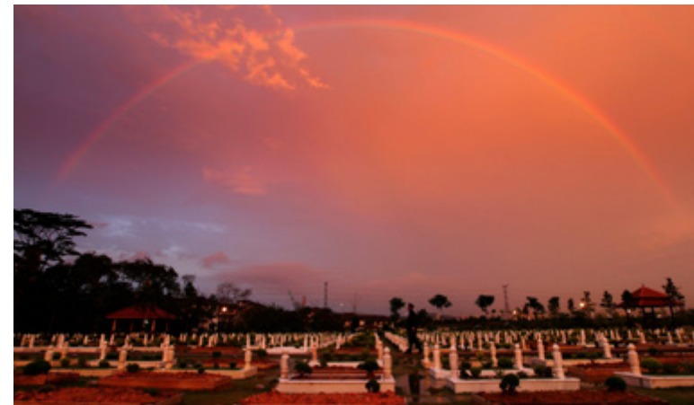
Chan Wai Yew Tanah Perkuburan Islam Raudhatul Sakinah, Taman Batu Muda, Kuala Lumpur, 2012

A loving wife – The disabled couple find shelter from a heavy downpour at the Pantai Dalam night market. The couple, who sell snacks at the night market for a living, had to close the stall due to the heavy rain.