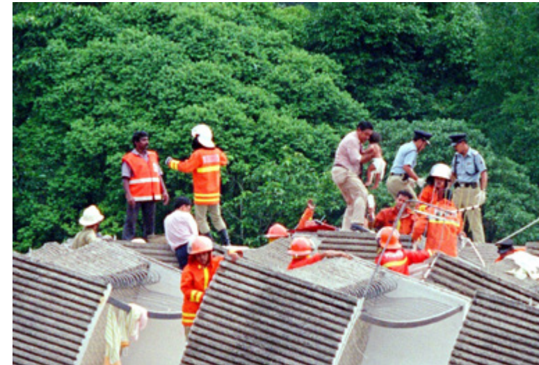
Highland Towers, Hulu Kelang, Selangor, 1993

Rescuers at the ruins of Highland Towers that claimed numerous lives. A baby was rescued in the process.