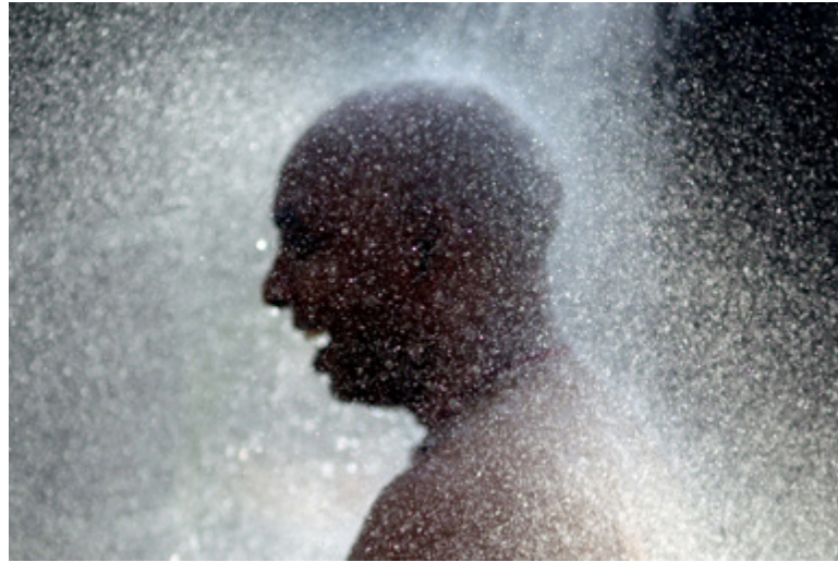
Aizuddin Saad Batu Caves, Selangor, 2017

Droplets maketh the man - A silhouetted man cleanses his body during the Holi festival in Batu Caves, Selangor.