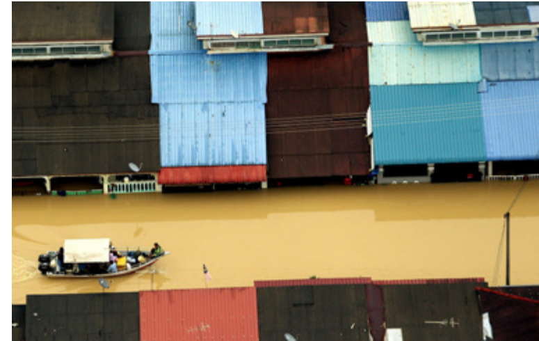
Sairien Nafis Jalan Kuantan, Gambang, Pahang, 2013

Pathway to safety - a motorboat is seen carrying people through a flooded road in Kuantan, Pahang.