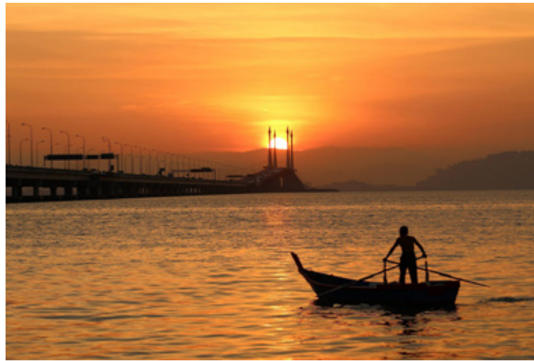
Lano Lan Maiga Island, Semporna, Sabah, 2013

Morning hopes for a fisherman, who paddles to sea with the Penang Bridge in the background. He is a symbol of determination and positivity.