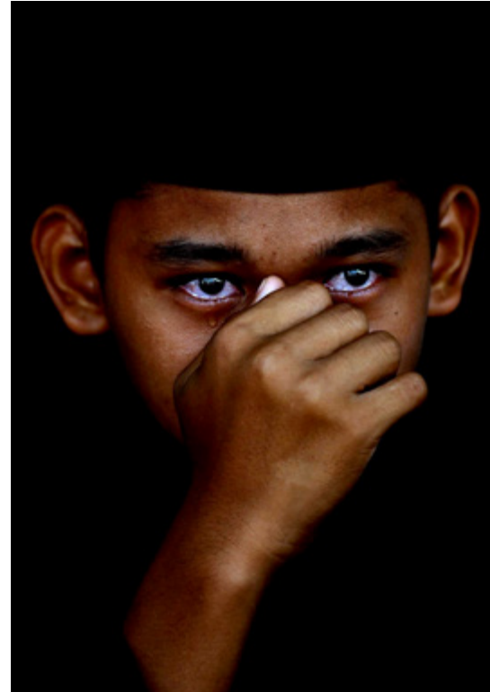
Pulapol, Kuala Lumpur, 2013