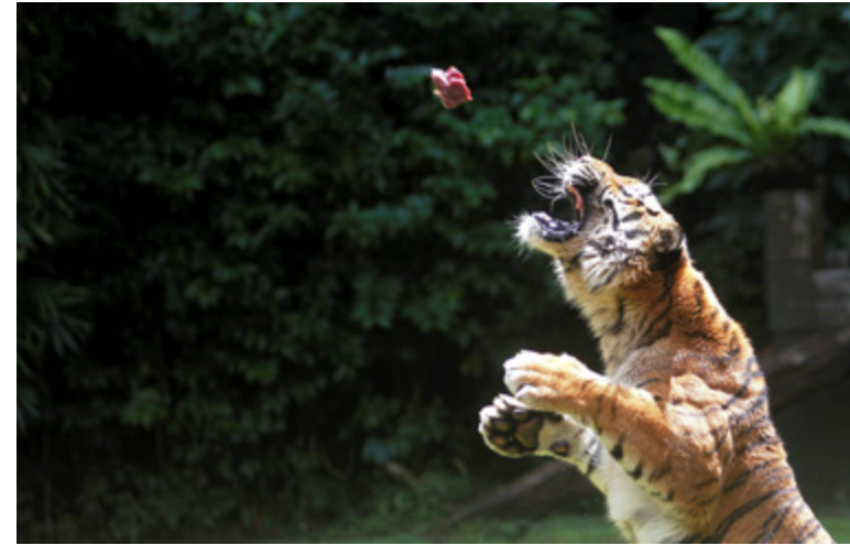
Supian Ahmad Lost World of Tambun, Perak, 2013