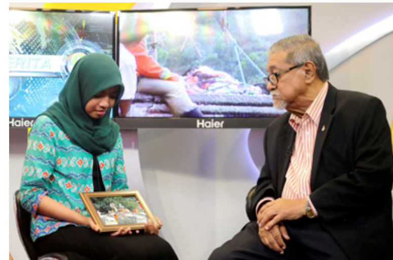
Aizuddin Saad Bandar Utama, Selangor, 2016

The next picture shows the now-adult survivor with one of her rescuers.