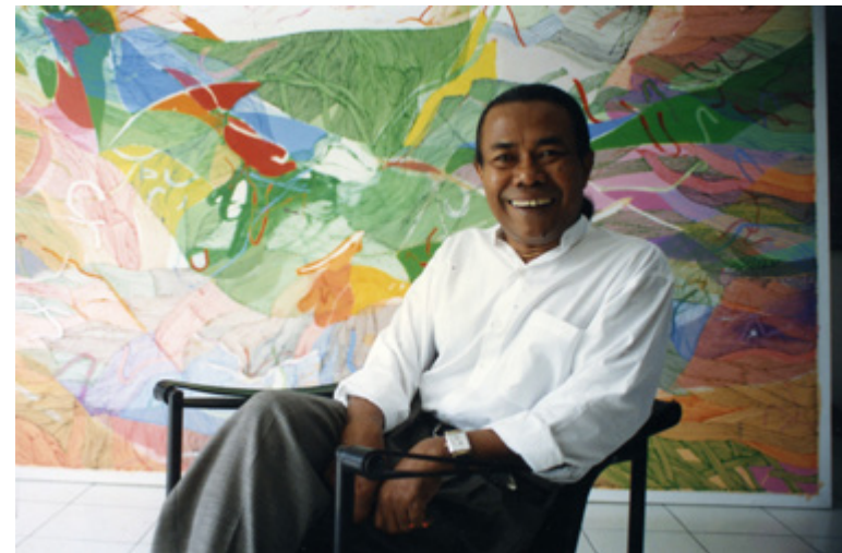
Langkawi, Kedah, 1992

POSSIBILITIES. A man in deep thought during the search-and-rescue mission for MH370 over the Malacca Straits.