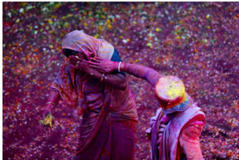
Aizuddin Saad Meera Sahbhagini Ashram, Uttar Pradesh, India, 2014

A Hindu devotee braves a ritual preparation prior to a kavadi procession during the Thaipusam festival.