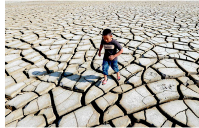
Amran Hamid Pattani, Thailand, 2014

Stop running, the ground is cracking! A child is seen stepping on cracks near Pantai Rusembilan, Pattani, Thailand.