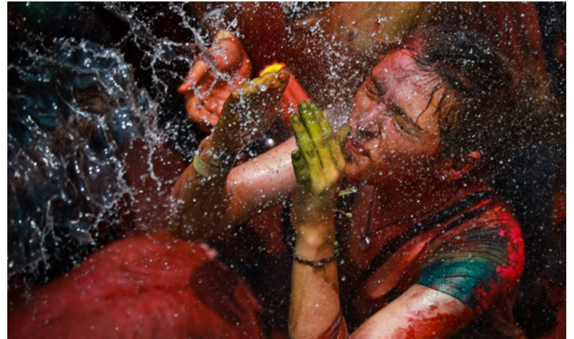
Kuil Sri Lakshimi Narayan, Kuala Lumpur, 2015

SPREAD THE LOVE - A Hindu widow is smeared with coloured powder during the Holi celebration by the community as a symbol of care and concern.