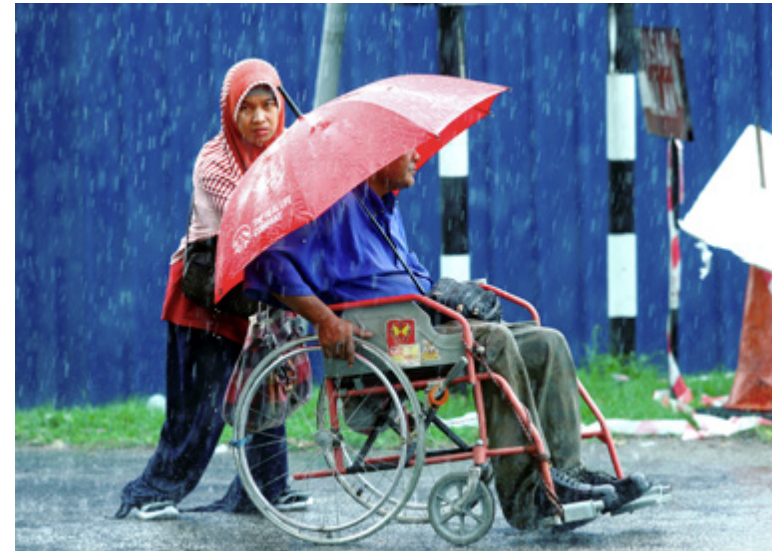
Pantai Dalam, Kuala Lumpur, 2014

Rescued pupils of Maahad Tahfiz Darul Mustafa, Meru, Klang cannot hold back their tears as they see their school being razed by fire.