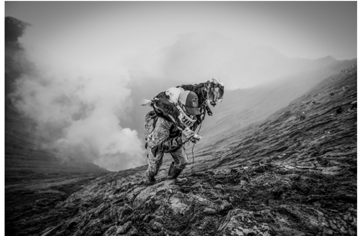
Adi Safri Mount Bromo, East Java, 2017

Couples of moths in flight in search of a light source, which they are attracted to.