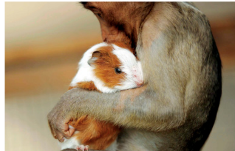
Sairien Nafis Ostrich Farm, Port Dickson, Negeri Sembilan, 2011

"Shhh, little creature. You're safe and sound now." If animals of different species can love each other, why can't humans?